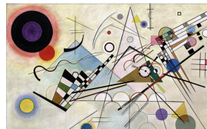
Composition 8 Kandinsky