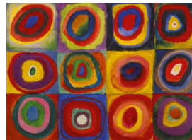
Squares with concentric circles Kandinsky