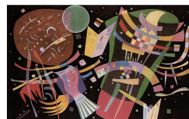
Composition X Kandinsky