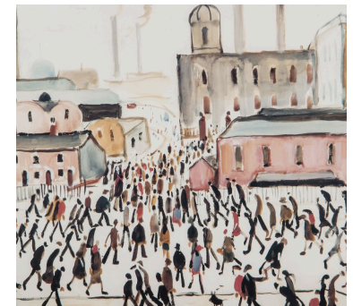
Going to Work 1959