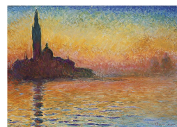
'San Giorgio Maggiore at Dusk' Claude Monet