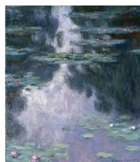
'Water lilies' Claude Monet