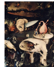
The garden of Earthly delights Hieronymus Bosch