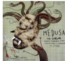
Medusa Sara Fanelli

Create your own versions of mythical creatures in collage using artists as inspiration