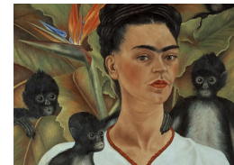
Sonho Tropical - Beatriz Milhazes